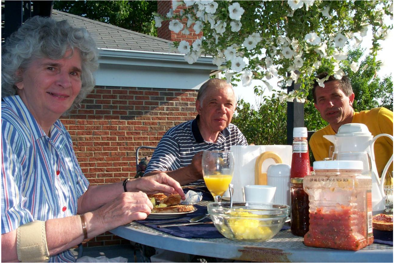
2nd pic - Backyard lunch in the gazebo.

Pastor had a love of flight. He often remembered with fondness the days when he flew a cub and that love never left him. That inward love probably was one of the factors that drove him to be out of sight but present, on my big day of 1st solo flight. The only picture memory that I have from that important day to me, came from Pastor. And I still cherish it.